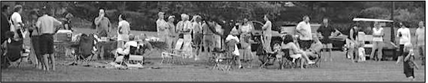
AGWG Civic Association members mingled with their neighbors over drinks and desserts at the Triangle Sept. 7.